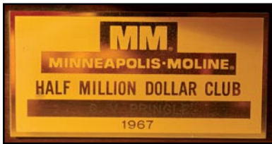
Toy G1000 on walnut plaque, The Half Million Dollar Club Award

out, I personally have only seen 3 different ones from individuals' collections in person or photos.