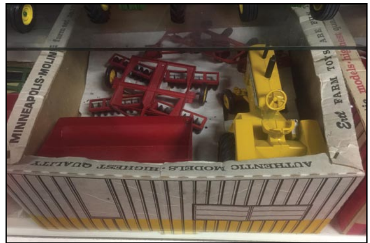
Original Vista Farm Set

The box that they came in could be folded into a machine shed. This is a rare set to come across. There is no evidence that this set was ever made with a white wheel Vista.